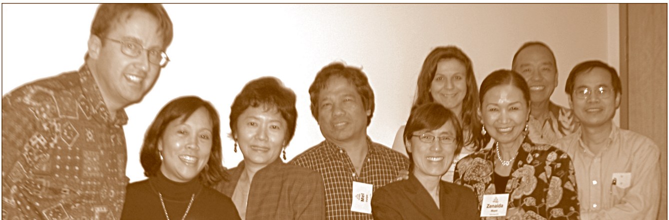
Clive with First Hawaiian Bank Students

★ NOTICE: Early registration rates apply to all registrations received postmarked by June 13, 2011 . The higher rate applies to all registrations after this deadline. You can still get the early registration rate if you register on-line. Register early or on-line to get the best rates!