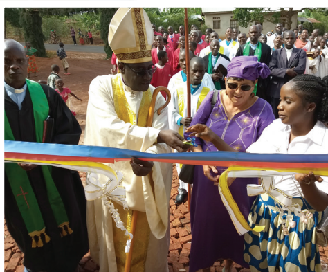
Dedication of Burundi's Urukundo (love) Church and Community Center in Central Africa