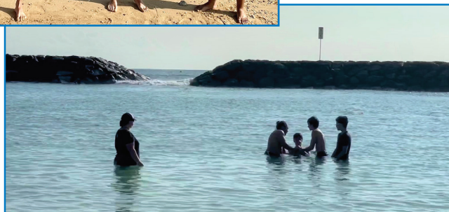
Mom (left) watching her son get baptized